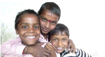
Together We Are Better 5:00 min, India By Prakhar Deep Jain (18-25 age category)

Synopsis: This video exposes stereotypes and labels women are unfairly subjected to, not only by society in general but also by other women.