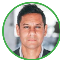
Paul Choy IOM National Goodwill Ambassador, Photographer and Writer (Republic of Mauritius/United Kingdom of Great Britain and Northern Ireland)